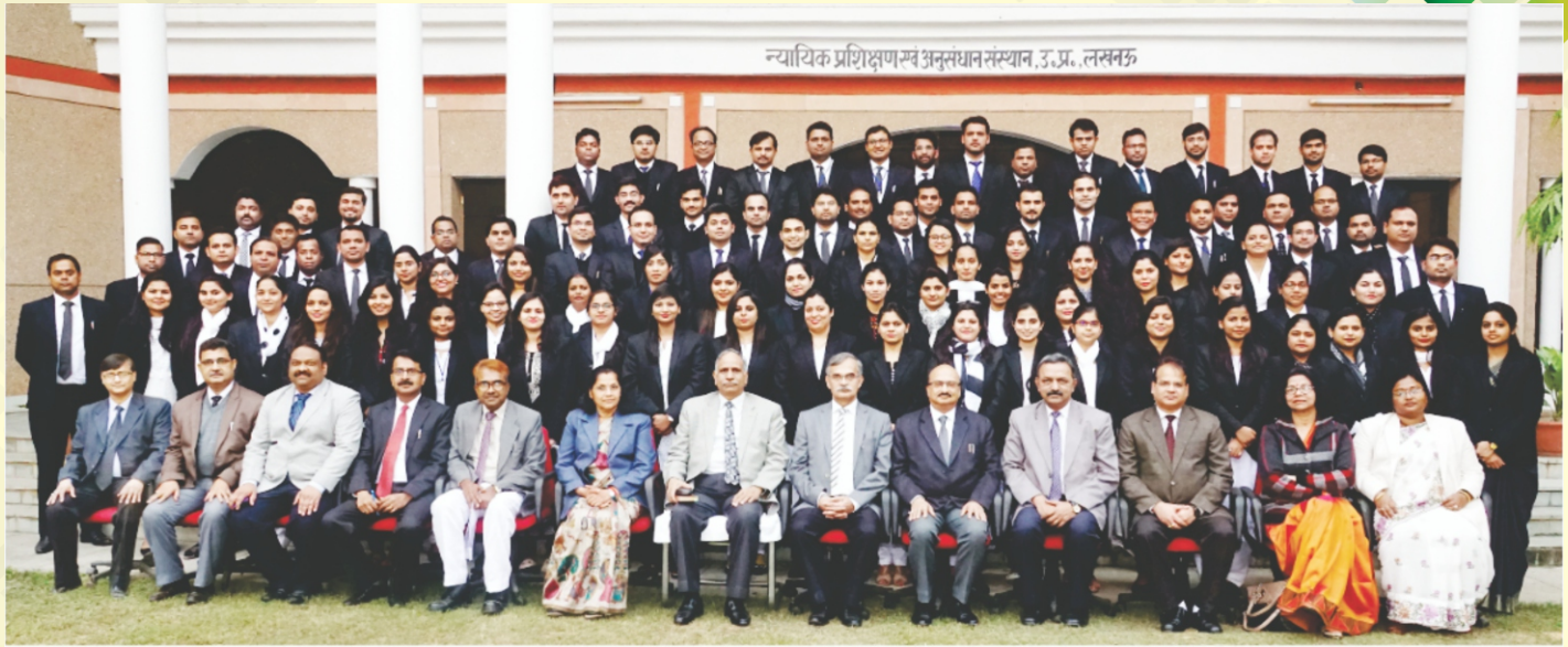
Chief Justice Hon'ble Mr. Justice Govind Mathur with Civil Judge (JD) in Induction Training Program