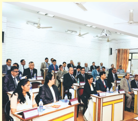
Inaugural Session of Refresher Training Prog. of District & Session Judges on 10 th September 2018