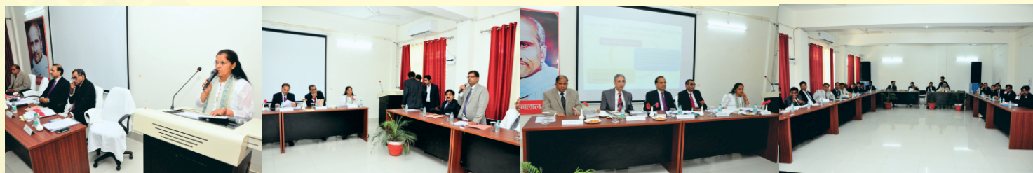
Judicial Training by way of Workshop, Refresher & Orientation Course at Cluster Jhansi on 19th May 2019