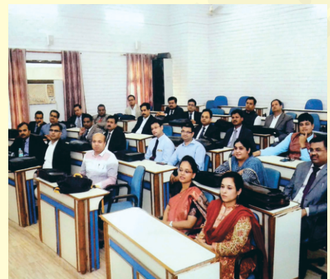
Advanced CIS 3.1 Training Program for Master Trainers under the Supervision & Direction of E-Committee of Hon'ble Supreme Court of India in JTRI on 11th & 12th May 2019