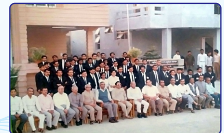
First Batch of Induction Training Civil Judges (JD) August, 1987