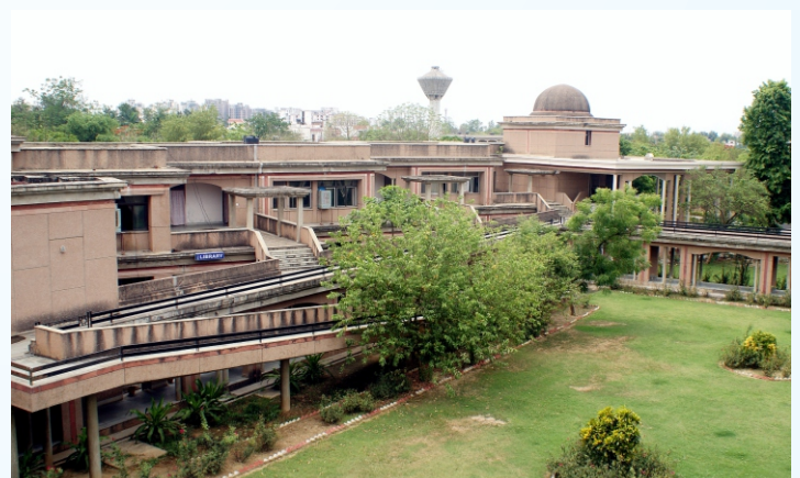
Training Block, JTRI