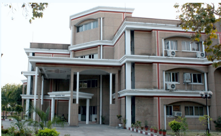
Administrative Block, JTRI