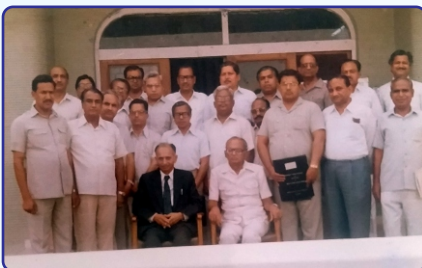
First Batch of Refresher Training - April, 1987